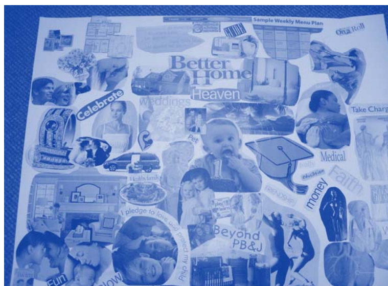
A “dream board” assembled by one of the participants in Baby Steps Step-Up Academy project.